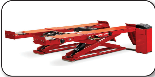
RX45KIS-215E Shown (jacks optional)