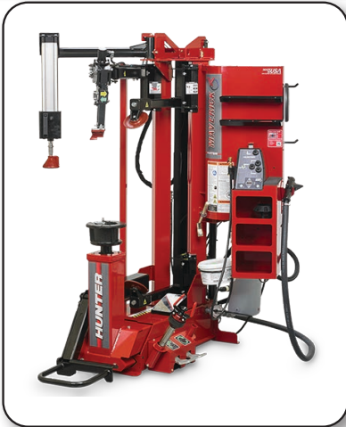
Maverick w/ Optional Wheel Lift